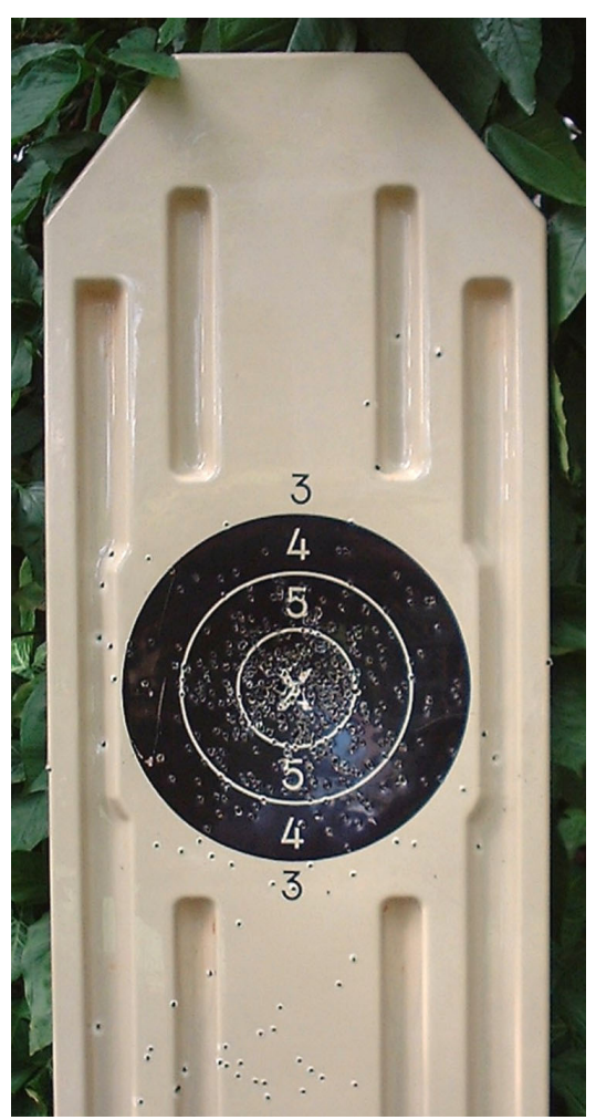
After over 500 rounds of 5.56mm.